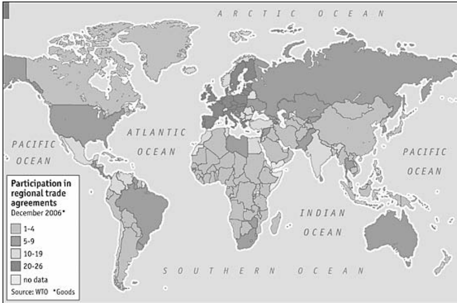
<Figure 3> Participation in Regional Trade Agreements 2006